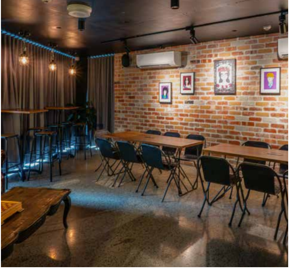
The Low Ground.