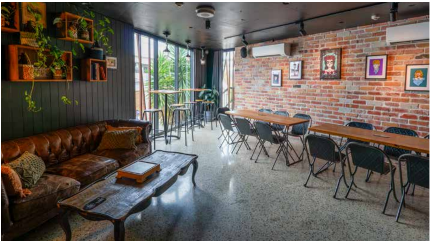
The Low Ground.