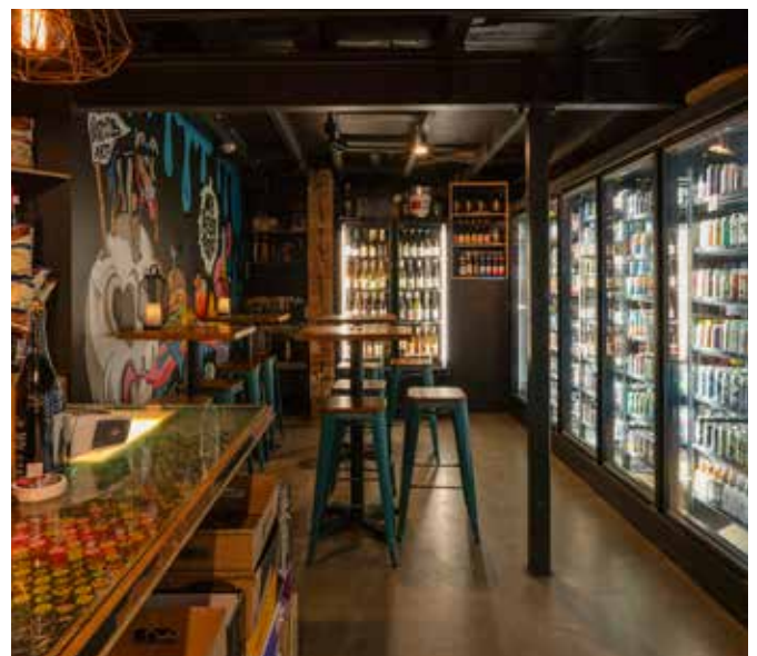
Brewski Underground: Cocktail Bar & Bottleshop